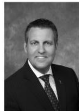
Honourable Cliff Cullen Minister of Justice Attorney General of Manitoba

A handwritten signature in black ink that reads "Cliff Cullen".