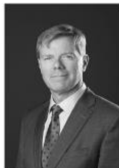
Dave Wright Deputy Minister of Justice Deputy Attorney General