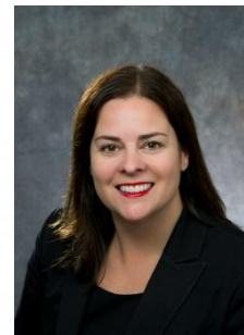
Honourable Heather Stefanson Minister of Justice and Attorney General

A handwritten signature in black ink, appearing to read 'Heather Stefanson'.