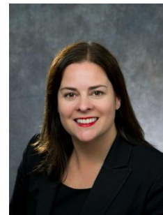
Honourable Heather Stefanson Minister of Justice and Attorney General

A handwritten signature in black ink, appearing to read 'Heather Stefanson'.