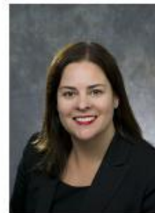
Honourable Heather Stefanson Minister of Justice and Attorney General