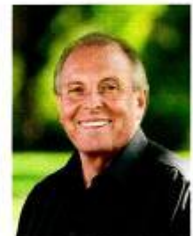
Honourable Ron Lemieux Minister

A handwritten signature in black ink, appearing to read 'Ron Lemieux'.