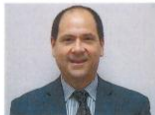
Terry Goertzen Deputy Minister Tourism, Culture, Heritage, Sport and Consumer Protection