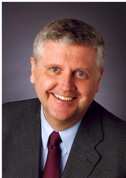
Honourable Gord Mackintosh Minister Family Services and Consumer Affairs

A handwritten signature in black ink, appearing to read "Gord Mackintosh".