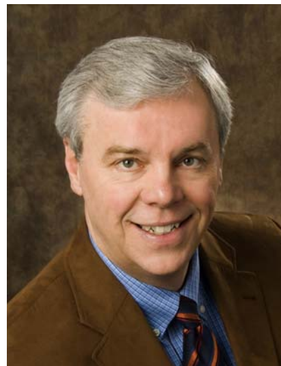
Honourable Greg Selinger Minister Finance

A handwritten signature in black ink, appearing to read "Greg Selinger".